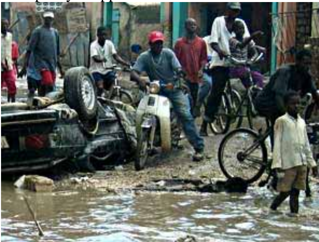
Flooding in Haiti caused by Hurricane Jeanne

This callous double standard, which places the value of a Third-World life below that of a Western one, is widespread within the media. Indeed, the other humanitarian crises on Medecins Sans Frontieres' list of under-reported stories (see page 3 article), for example the civil wars in DR Congo and Uganda, also took place in poor, black, Third World countries. When compared with the level of coverage afforded to, for instance, the terrorist attacks in Spain or Hurricane Katrina, a clear and consistent discrepancy is apparent.